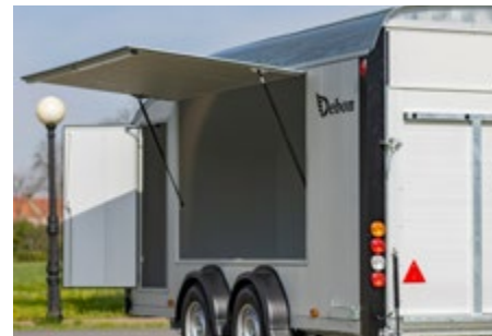
Option : Opening with side tailgate